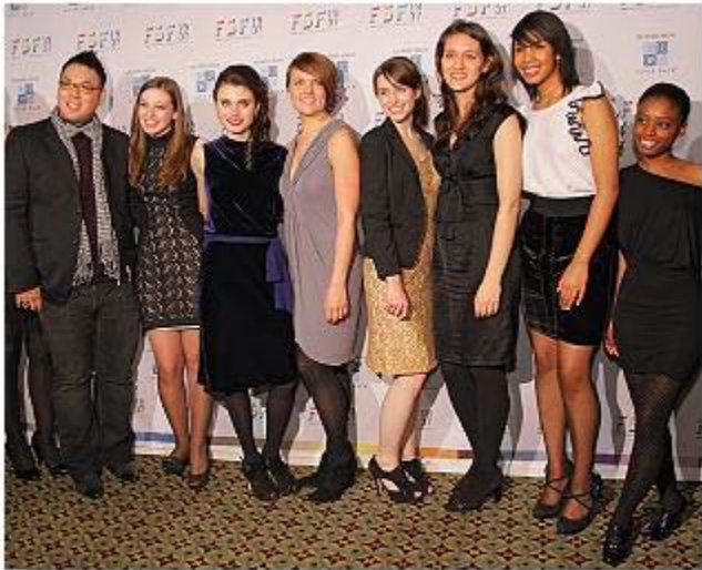
This year's eight Geoffrey Beene National Scholarship Awards finalists